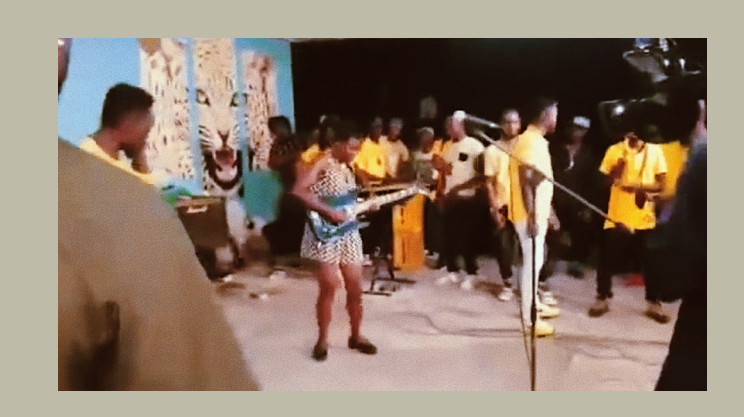
SOLO YA SARAH (on screen)