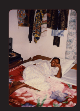
SEOUR EN CHRIST