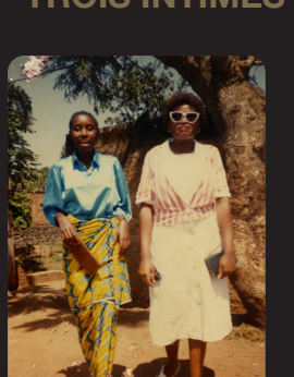
IGEGA EN BUT ROUTE