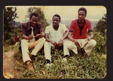
JULE ET FRÉRE