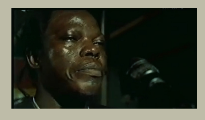
KILIO, YA REMMY ONGALA (on screen)