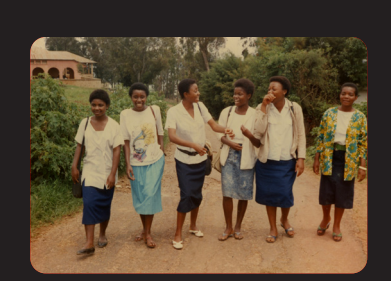
IGEGA VA À L'ÉCOLE